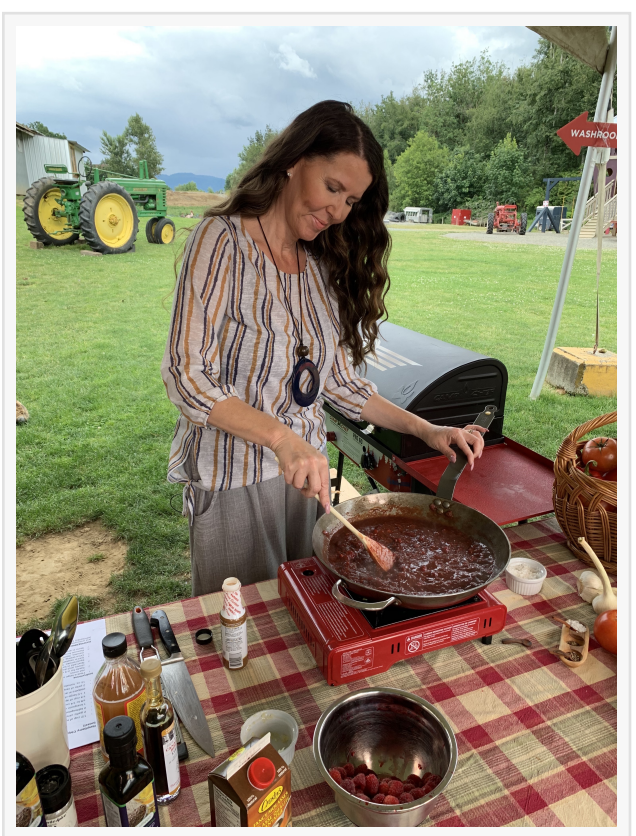
Creating new recipes in the kitchen is my favourite thing to do.....

You can see the amount of passion she has for her show, <u>Health Wellness & Lifestyle TV</u>, now in its 6th broadcasting season. It has been a journey of discovery as she didn't have extensive training in