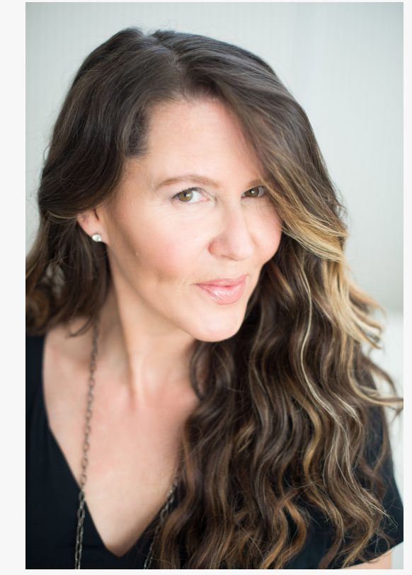
Turning 50 has been a journey of courage, learning and growing.

was now or never. I wanted now.", she finishes with an even bigger smile.